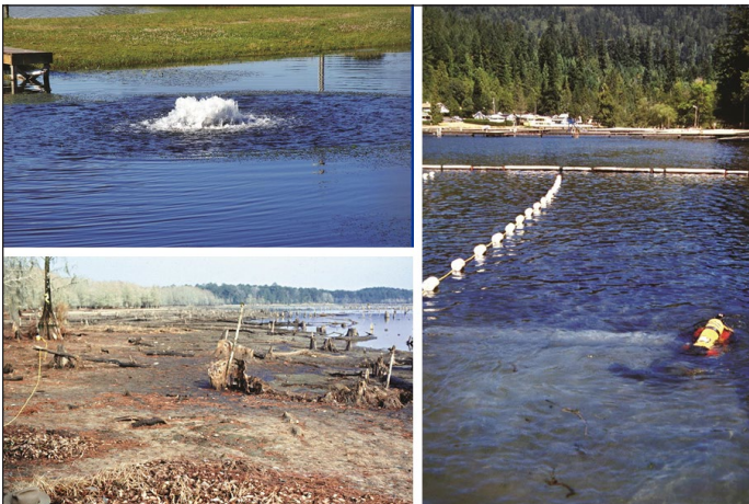
Figure 12. Cultural control methods. Upper left: aerator. Lower left: drawdown. Right: benthic barrier being deployed.

Cultural and physical control methods (Fig. 12) can sometimes be used if they are appropriate for your situation. For example, some populations of algae can be reduced by aerating the pond (introducing oxygen to the bottom of the water column), adding alum to inactivate phosphorus in the water column, or using dyes or pond covers to reduce light penetration. However, these methods are most effective before serious algae blooms occur and have limited use once algae has taken over a pond. Submersed weeds can be managed by installing benthic barriers, which smother the weeds; these can be made from durable materials such as vinyl or plastic or from biodegradable materials such as burlap. Submersed weeds also can be controlled by lowering the water level (drawdown) and allowing the bottom sediments to dry out for several months. Although useful, benthic bar-