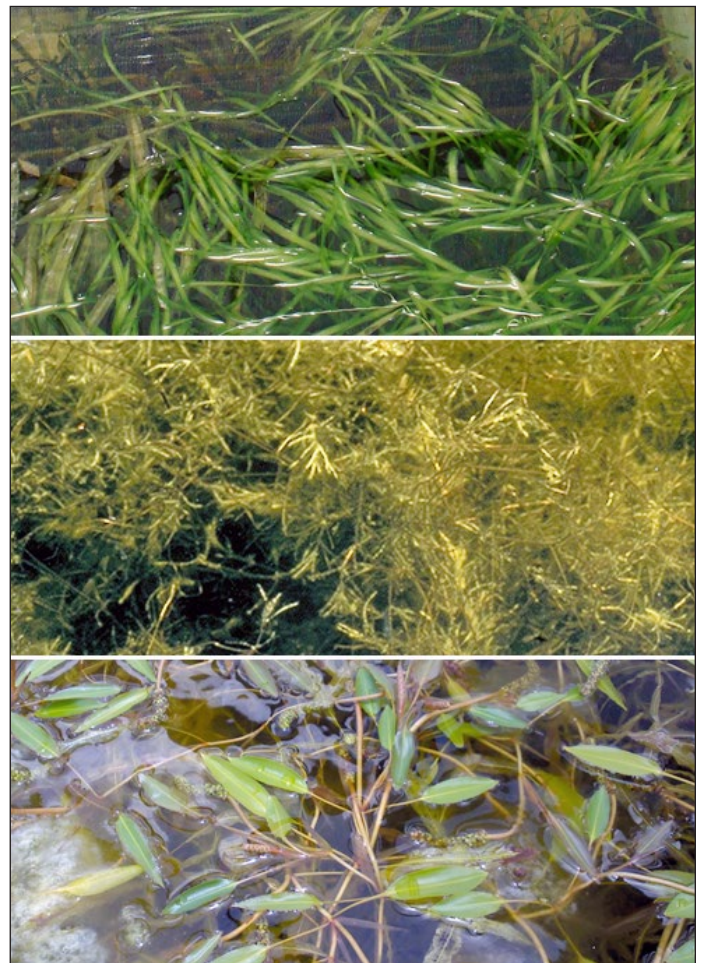
Figure 8. Native submersed plants. Upper: eelgrass. Center: southern naiad. Lower: Illinois pondweed.

In order to select the most effective weed control method, the invader must first be positively identified. The most common way to do this is to send high-resolu-