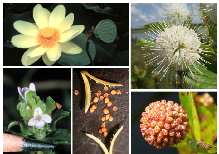
Figure 11. Reproductive structures. Clockwise from upper left: flower and unripe seed pod; inflorescence; ripe seeds; capsule with seeds; flower size and position.

If possible, collect and press a specimen for reference. If the species has not been found in your area before, your local herbarium may ask you to submit a dried sample so they can voucher the plant and have a record of its presence.