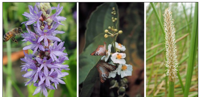
Figure 6. Native shoreline emergent plants. Left: pickerelweed. Center: duck potato. Right: Gulf Coast spikerush.

Emergent plants are rooted in the sediment, but some or most of the plant's growth is above the waterline. Shoreline or littoral zone emergent plants are usually found in the transitional zone between deeper water (more than 3 feet [1 m] deep) and the moist shoreline. Emergent shoreline plants help to stabilize the shoreline and prevent erosion while providing food, cover, and nesting grounds for animals that live near water. Native emergent shoreline species include pickerelweed ( Pontederia cordata ), duck potato ( Sagittaria latifolia ), and rushes ( Eleocharis , Scirpus , and Schoenoplectus sp.) (Fig. 6). Emer-