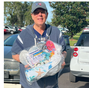
Browns Tree Service $1,500 R.C. Cruise Alan Hirsh