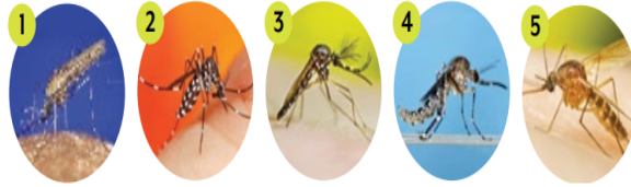
[1] ANOPHELES - is the primary vector of malaria. [2] AEDES ALBOPICTUS -Asian Tiger Mosquitoes. [3] AEDES AEGYPTI -Yellow Fever Mosquitoes. [4] AEDES TAENIORHYNCHUS -Black Salt Marsh Mosquitoes. [5] CULEX - House Mosquitoes [2-5] can all transmit viruses that cause Chikungunya, Dengue, West Nile, and Zika.