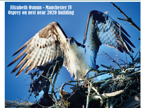
Elizabeth Osmun - Manchester IV Osprey on nest near 2020 building

Submit your entries to master@kpmaster.com