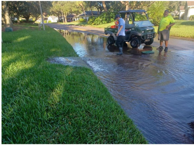
6" Mainline Repair on Hammersmith