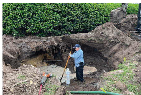
8" Mainline break on Hammersmith

While it isn't possible to completely prevent mainlines, the Master Association makes every effort to put measures in place to help minimize the breaks as much as possible. Master procedures require the