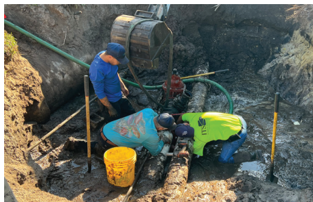
The close proximity of this 8" mainline break running parallel to an 8" county mainline makes for a difficult repair with little room to work.

What causes a mainline break? Mainline breaks are caused for