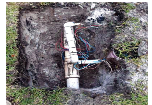
4" Mainline Repair in Oakley Green

use of Mechanical Joint (MJ) fittings on every repair. MJ fittings are made of metal and allow the joints to be sealed tightly without the use of glue. This greatly reduces the chance of future mainline breaks in the same location as approximately 90% of mainline breaks are caused by the weakening of the glue joints on PVC fittings.